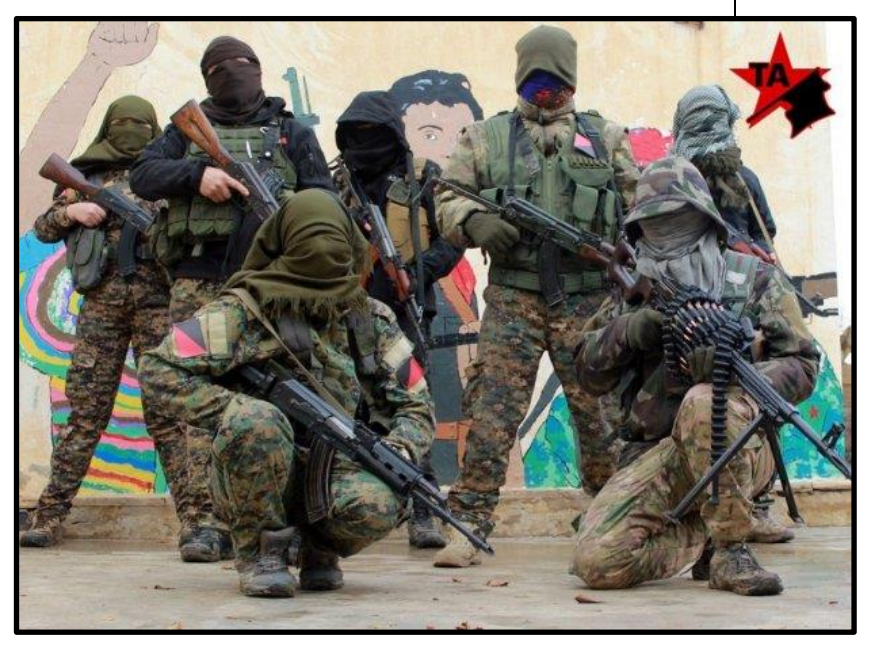
10 Class War # 13 / summer 2021

There are many cases of how leaving for Rojava really changed people's lives. However, not only positively, e.g. by gaining valuable experience and inspiration, but also negatively, e.g. by crippling relationships with his loved ones in the places from